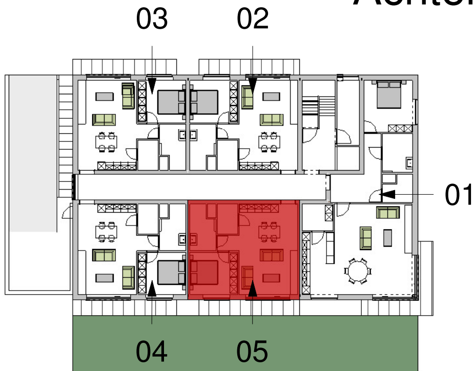
App. 05 - situering