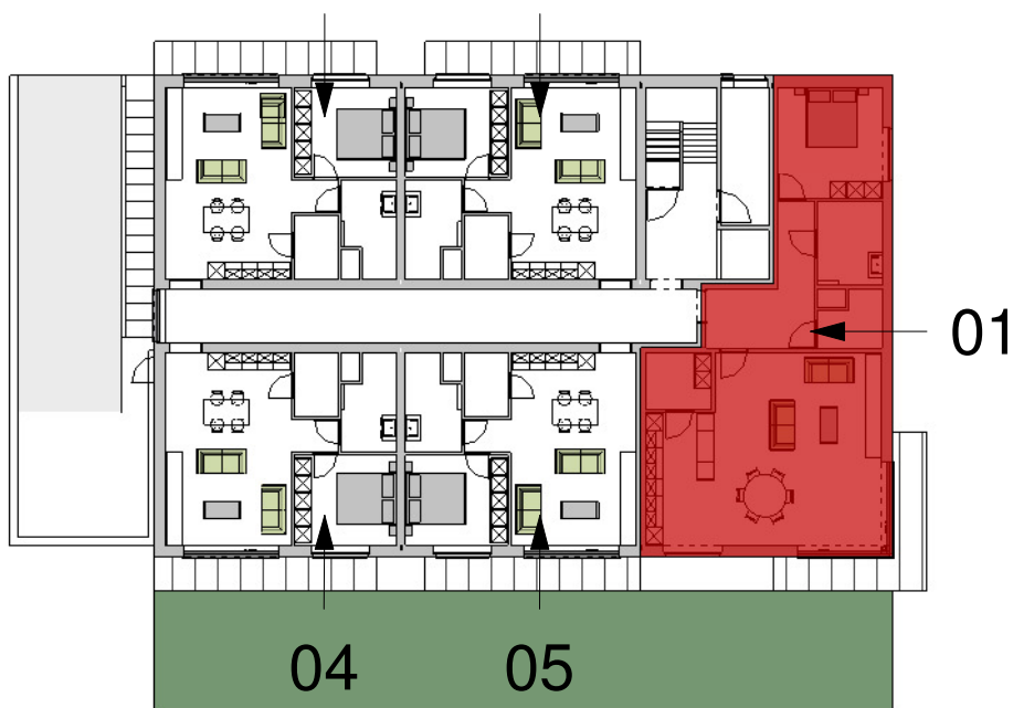
App. 01 - situering