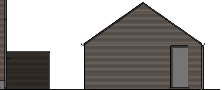
② facade laterale gauche, garage G10 1 : 50