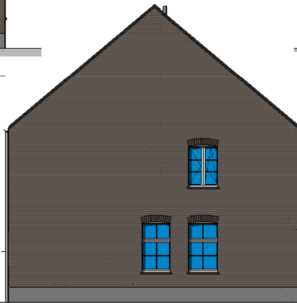
① facade laterale droite 1 : 50