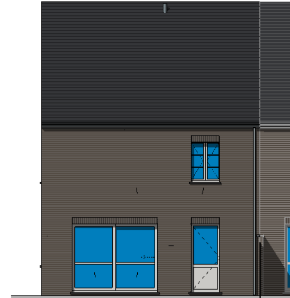
⑥ facade arriere 1 : 50