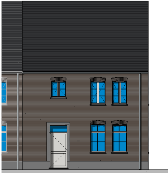
③ facade principale 1 : 50